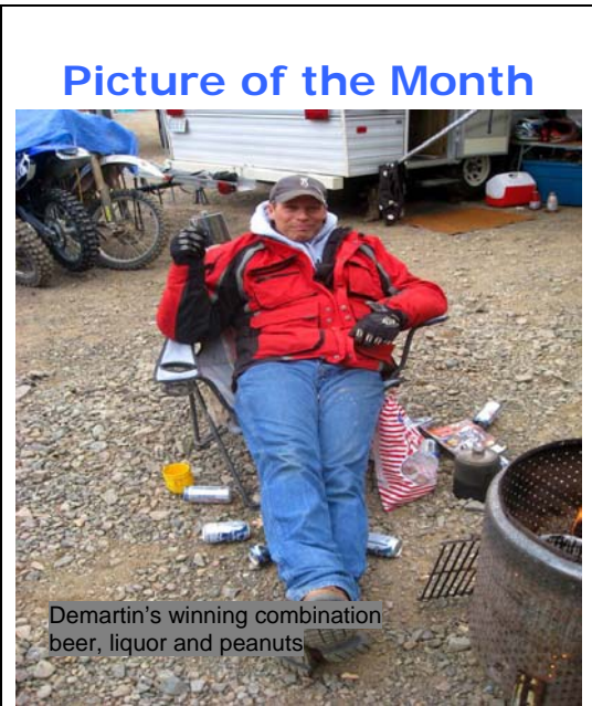
Picture of the Month