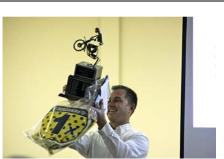
What a happy guy!!! Now his wife knows where all his money went.