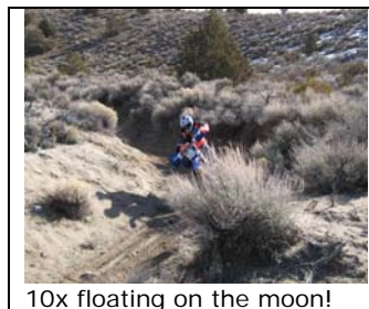
10x floating on the moon!

Watch your e-mail for more Pine Nuts rides to come and maybe even an overnight dual-sport to Bridgeport.