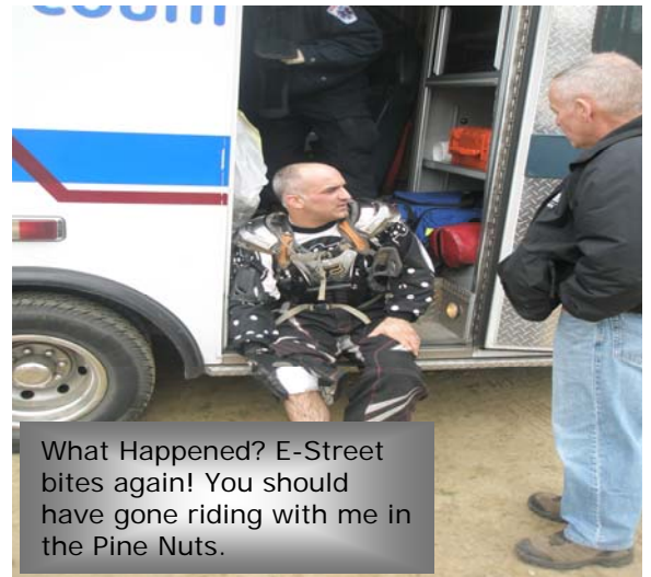
What Happened? E-Street bites again! You should have gone riding with me in the Pine Nuts.